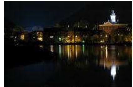
Exeter NH June 2006 Pr